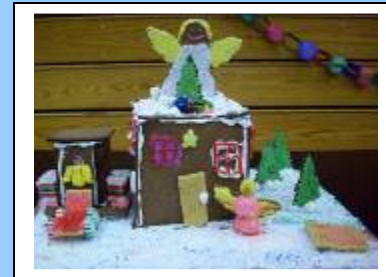
A gingerbread entry

May – Outdoor Adventure - 7 th Grade Box out for the Homeless