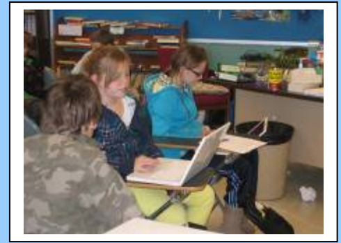
7 th grade Project Reach hard at work researching local non-profits.